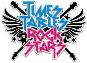
TT Rockstars (maths)